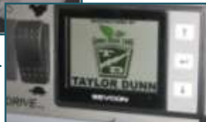
(SFD) System Function Display