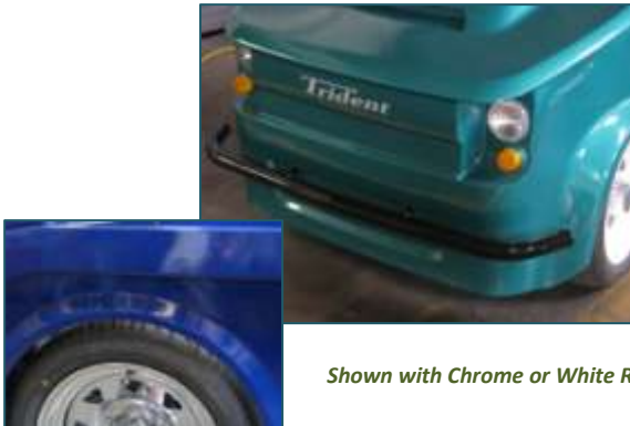
Shown with Chrome or White Rims