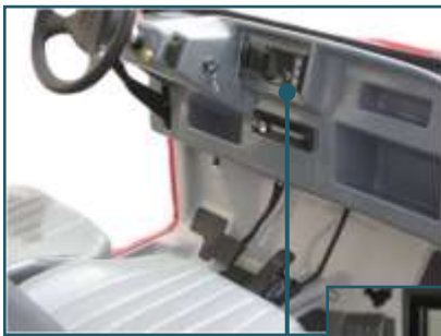
Radio, CD, MP3 Jack, Horn, Key Switch, Storage Space, Forward/Reverse Selector, and Hand Parking Brake