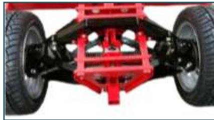
Independent Front Suspension, Coil over Shock Absorbers, Rack and Pinion Steering, and Disc Brakes